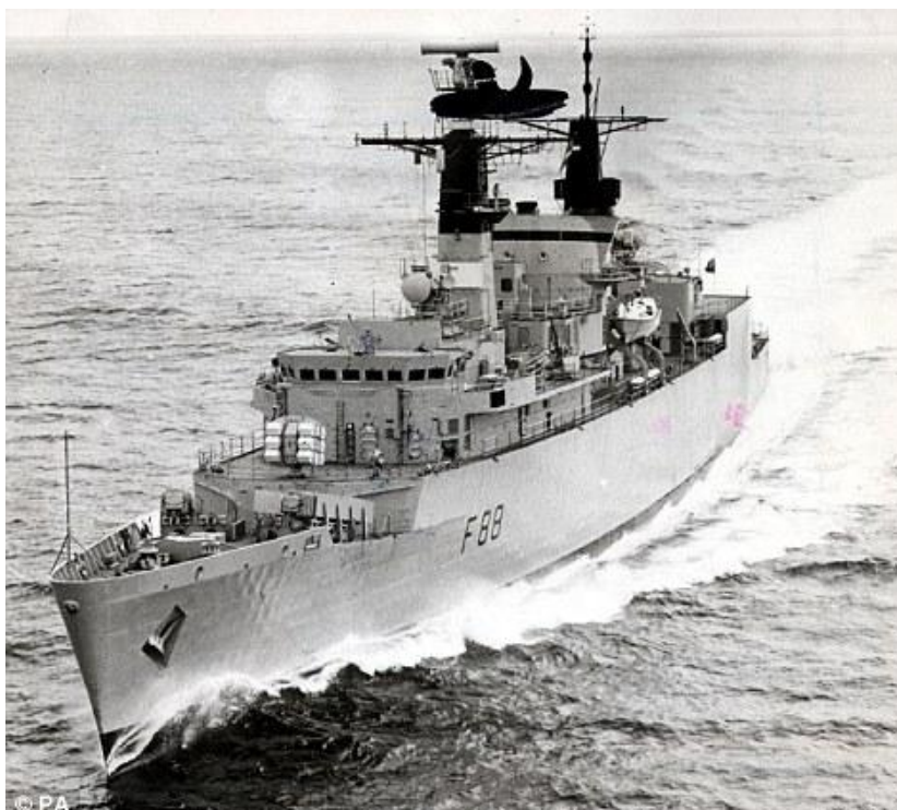
Surprise attack: An A-4 Skyhawk (left) similar to the ones used in the Argentine assault on HMS Coventry and HMS Broadsword (right), the Royal Navy type 22 frigate that was patrolling alongside the doomed destroyer at the time of the attack on May 25, 1982